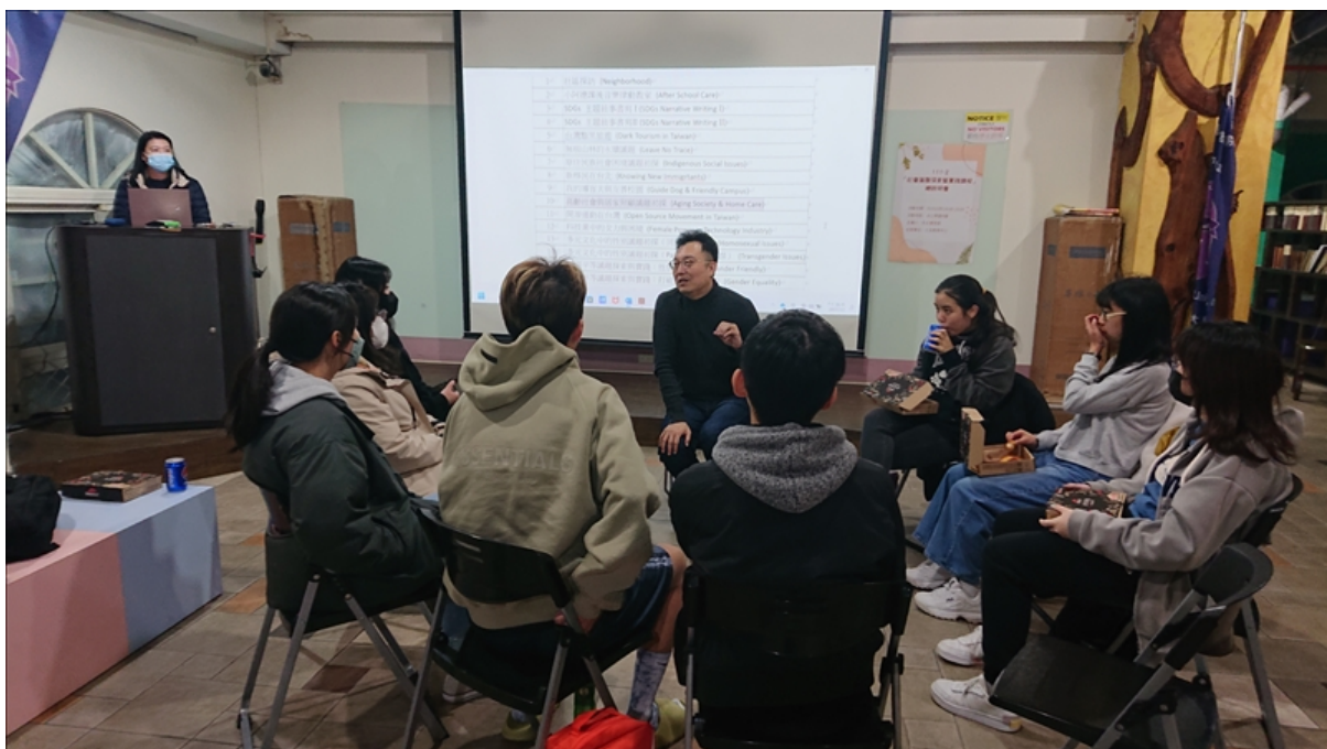
Introducing the purpose of the "Exploring and Implementing Social Issues" course.