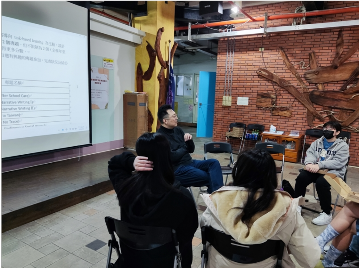
Discussing views and reflections with the students.

Location : Tamkang Hall Dormitory R floor