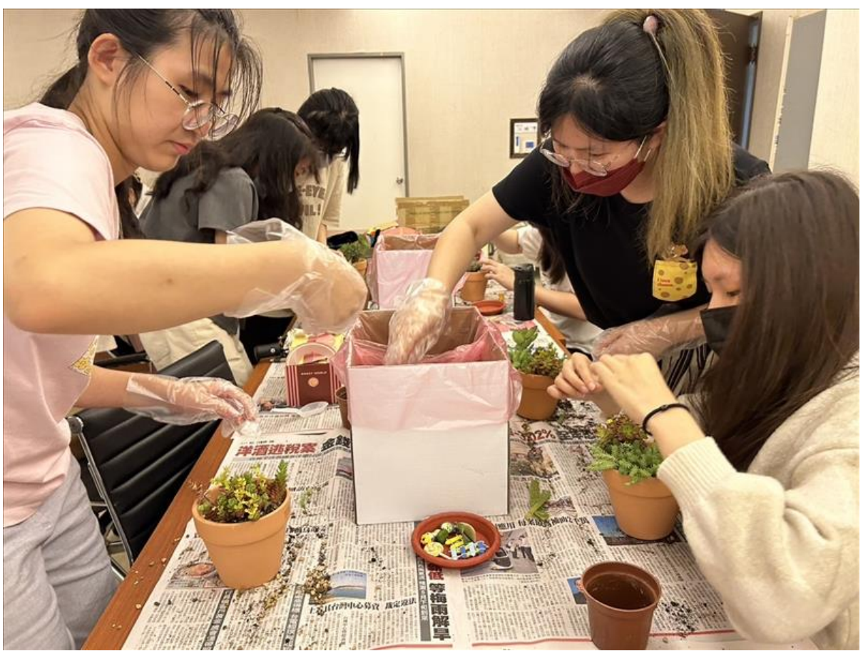
The students in the process of creating their own potted plants.