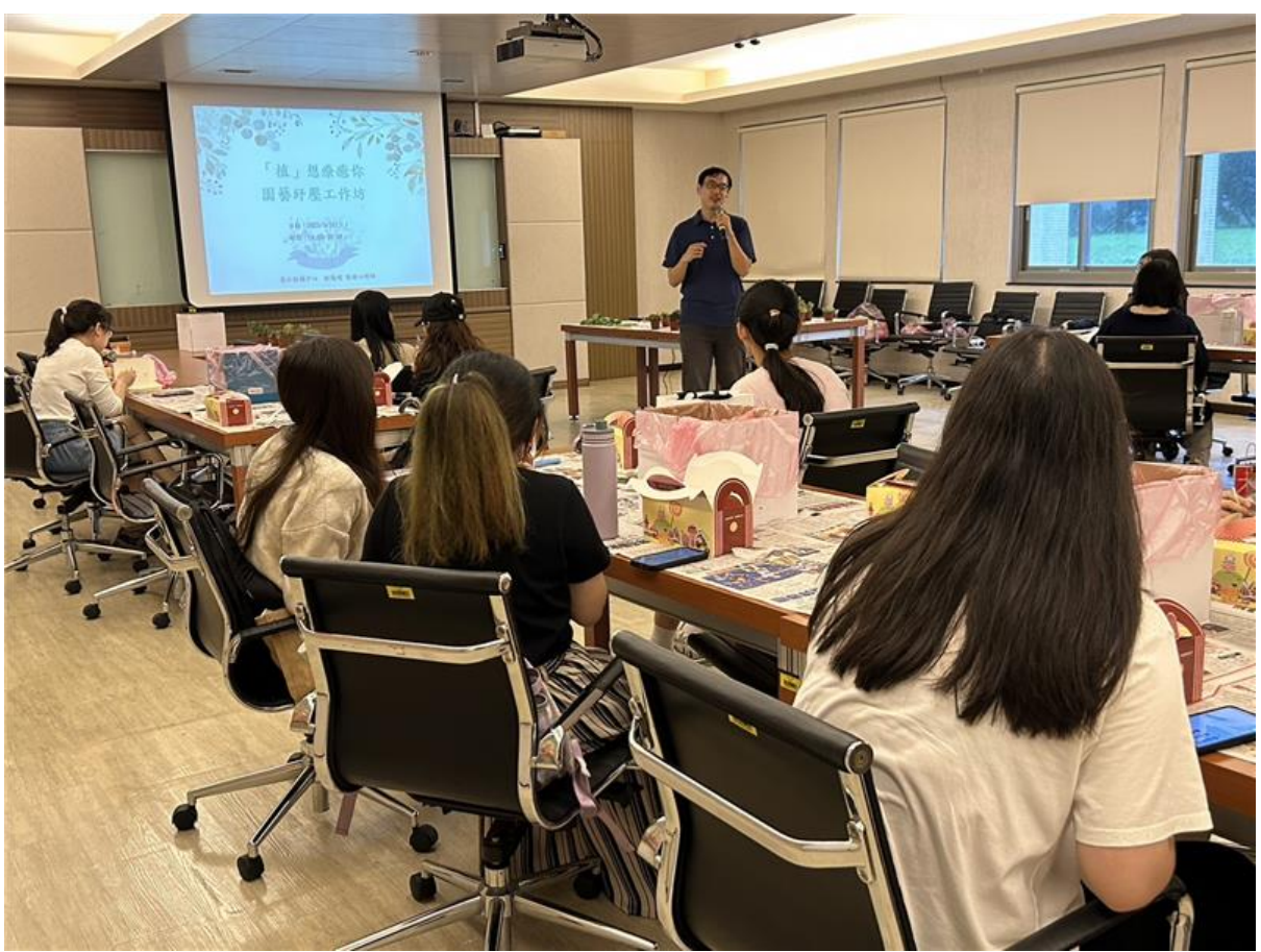
The instructor sharing some basic knowledge about plants.